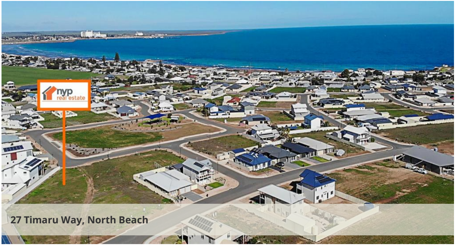
27 Timaru Way, North Beach